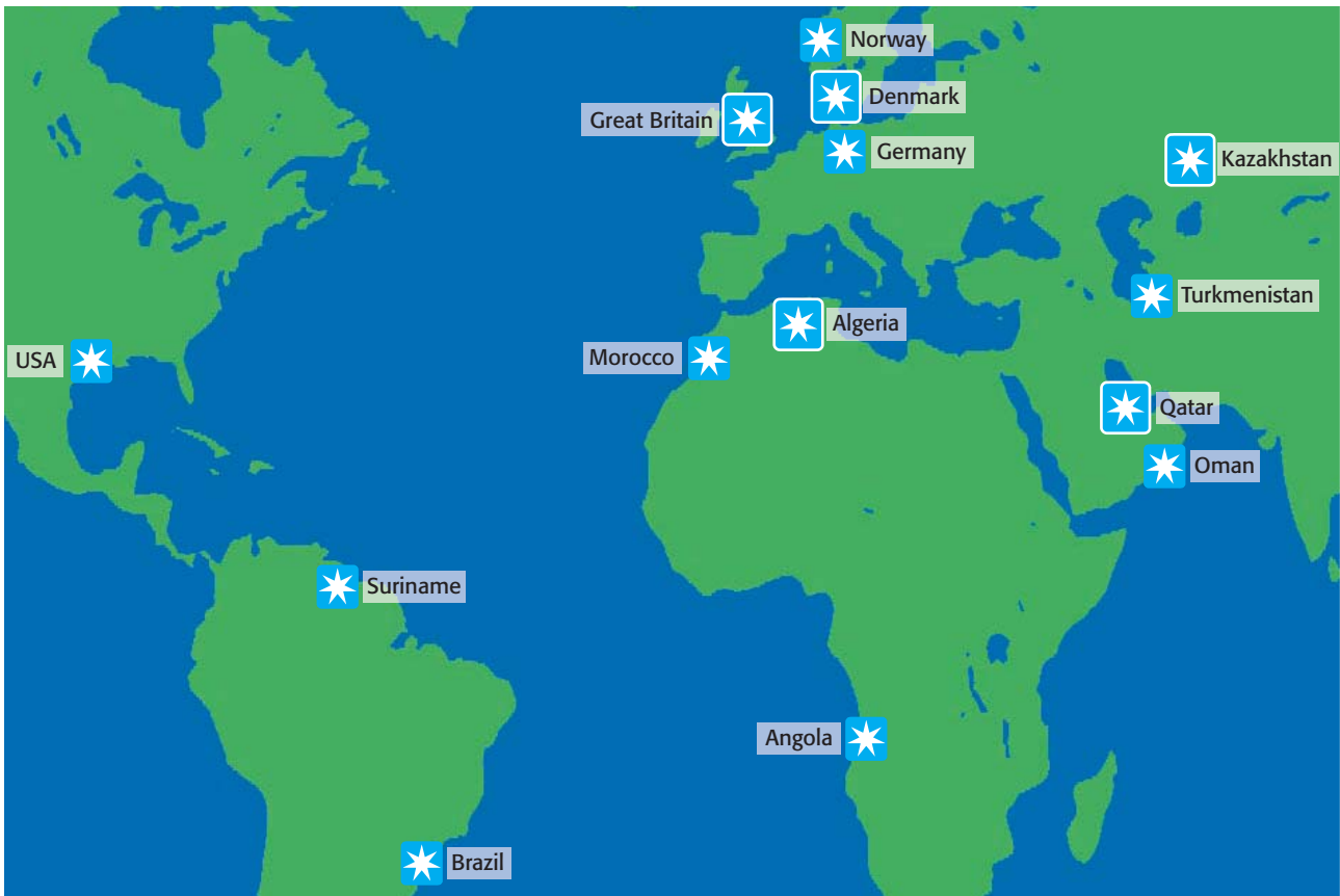
Maersk Oil, production and exploration, 2007

In Algeria, Maersk Oil is a member of a group that has Anadarko as its operator in cooperation with the state-owned oil company Sonatrach. In 2007, Maersk Oil's share of production remained unchanged compared to