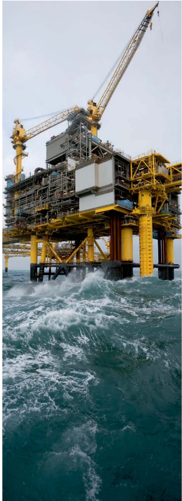
Maersk Oil's platforms in the North Sea are built to endure extreme weather conditions.

In 2007, five rigs drilled 13 new wells for Maersk Oil in the Danish sector of the North Sea – primarily for production. Three new platforms were installed at the Halfdan Field, along with a number of new wells. Further development of the Halfdan Field has been approved, with new wells and a processing platform which are scheduled to go on-stream in 2011.