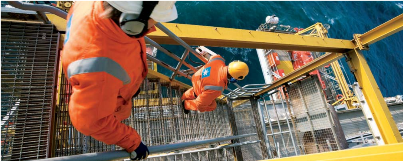
For the employees of Maersk Oil, safety is always a high priority. Instructions such as "Always at least one hand on the railing" help secure safety for the crew in daily operations.

2006 at around 12 million barrels. As stated in the annual report for 2006 and the interim report for 2007, the government of Algeria introduced an additional tax on oil earnings which came into effect in 2006. The total effect of this extra tax – USD 330 million, including the effect for the period 1 August to 31 December 2006 (USD 50 million) – has been included in the tax charge for 2007. The contract between the Algerian authorities and Maersk Oil contains provisions for the protection of the financial balance between the two parties which is subject to discussion with the authorities. An impairment loss has been recognised in the financial statements in respect of construction in progress concerning the El Merk project. Realisation of this project is still awaiting satisfactory clarification with regard to oil taxation in Algeria.